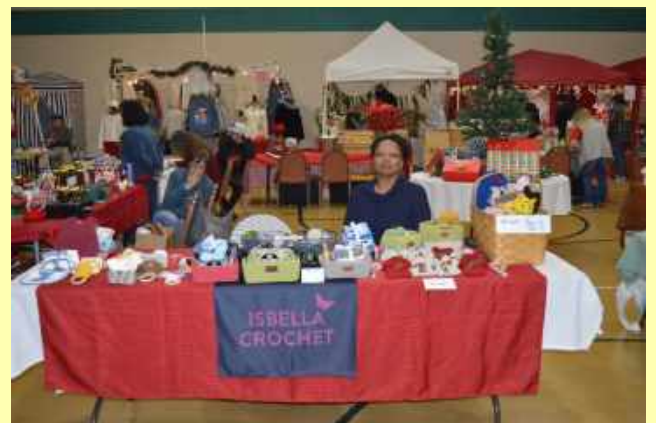
Vendor Booth: IsBella Crochet