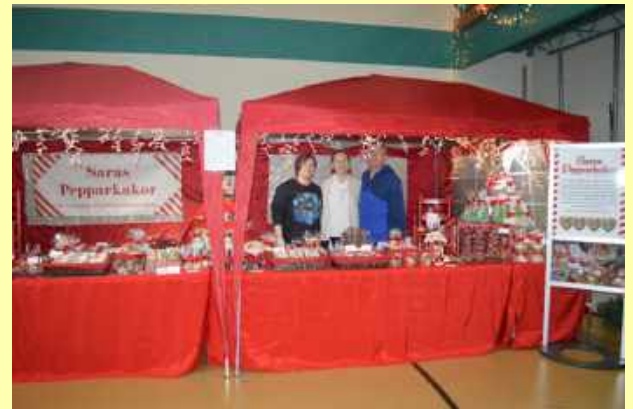
Vendor Booth: Saras Pepparkakor