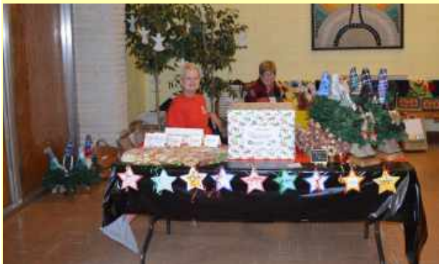
Member Arts and Crafts